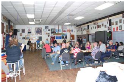
ASC Christmas party