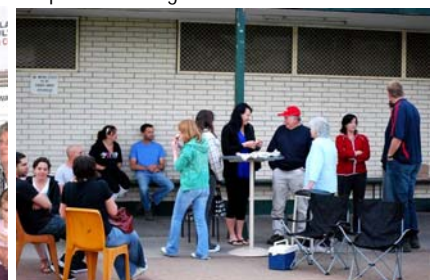
ASC Christmas party