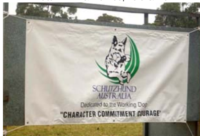
Schutzhund Australia banner